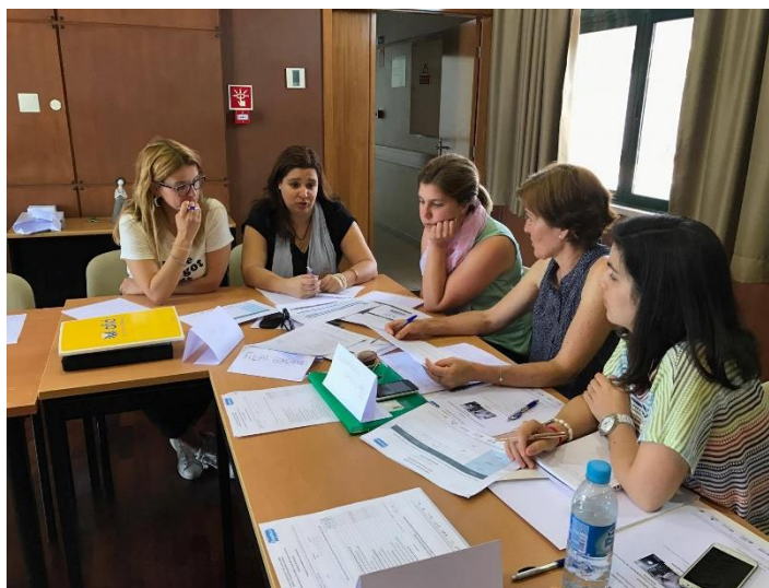
Image 2: Working Group 2 - Practices Validation Process during the Workshop Validation

Regarding the methodology, it has shown some limitations. In Portugal only 5 organizations participated on the study. Based on the feedback that we have received, it was due to several reasons. First of all, the organizations have found the questionnaire too complex and difficult to fill-in; others have replied us saying that they don't have either time and human resources to participate on the questionnaire. Another possible problem was that, at the very beginning, we asked participants to fill in the questionnaire in English. We think that this was also a barrier to the participation.