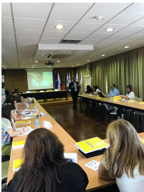
Image 1: DESIGN project presentation during the Workshop Validation